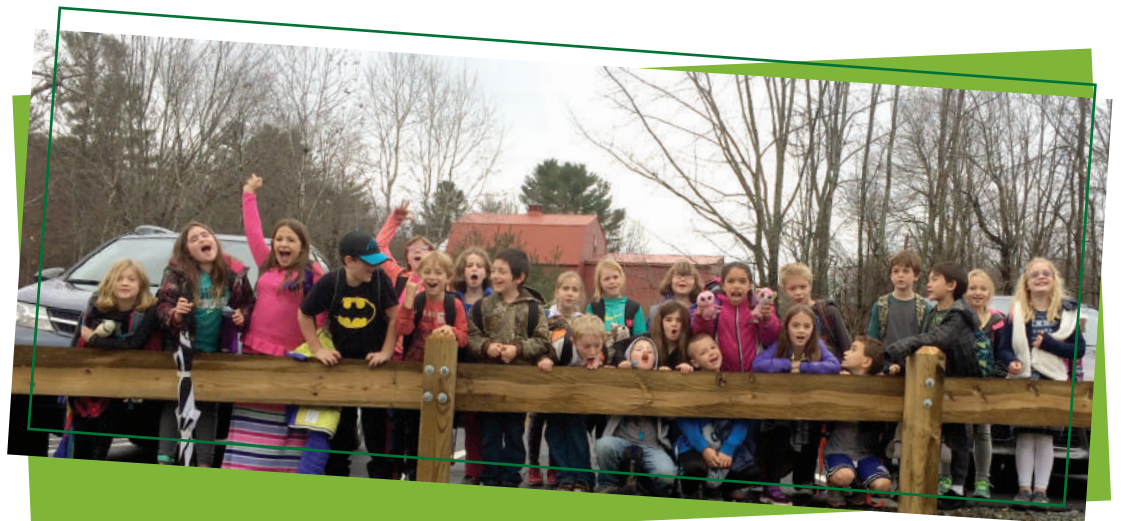
The After School kids show off the new upper parking lot.

Remember your gifts to the Abbott Library Foundation are tax deductible.